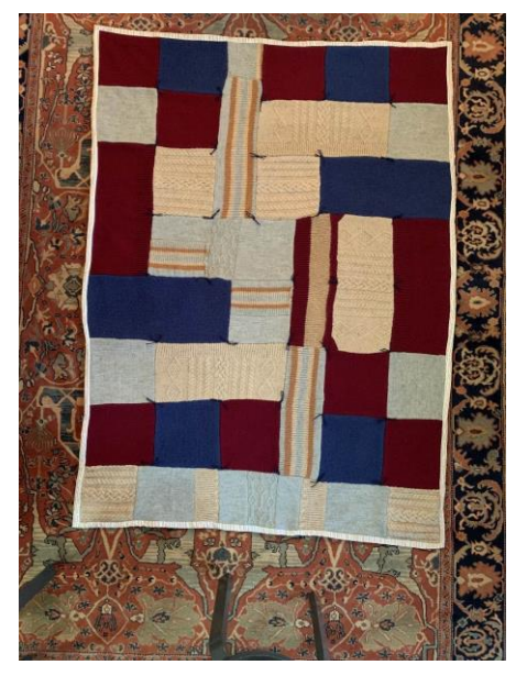
A throw made from four old jumpers and a sheet - December 2019